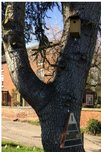
Bird Boxes and Bug Hotels have been installed around the Parish.