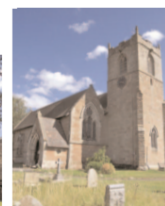
Lapley with Wheaton Aston Blymhill and Weston-under-Lizard