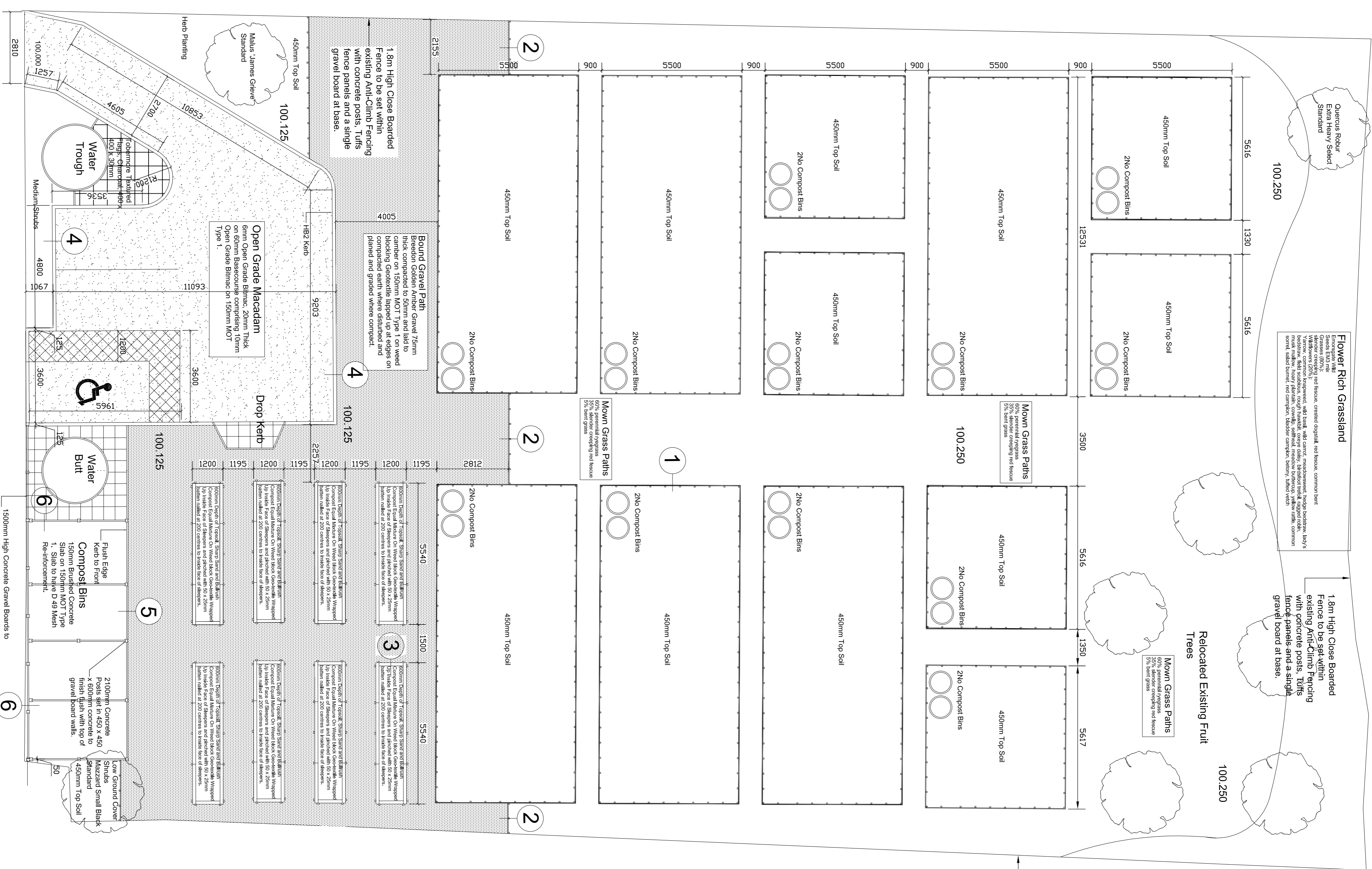
Proposed Site plan